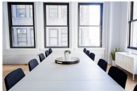
Movement to assigned room via navigation